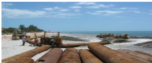
Sand being placed during 2006 nourishment

A beach nourishment design is determined using a number of engineering parameters. Through physical process and economic models, engineers calculate the required volume of sand, the volume of sand needed