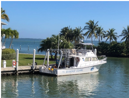
The R/V Eugenie Clark is docked at South Seas.