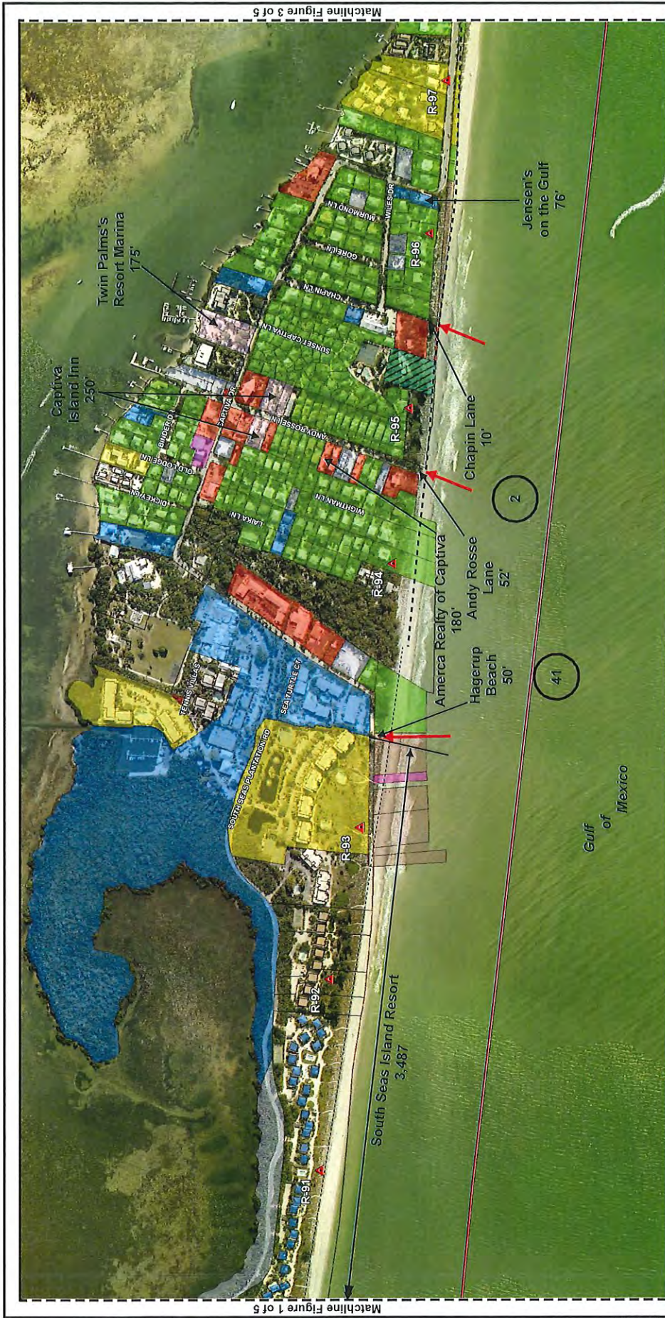
Matchline Figure 3 of 5